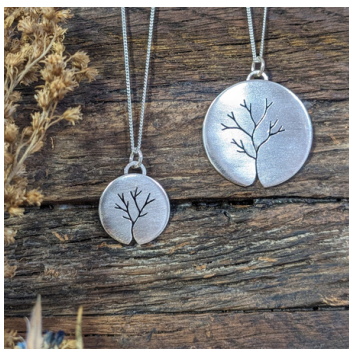
Mini Sycamore Pendant