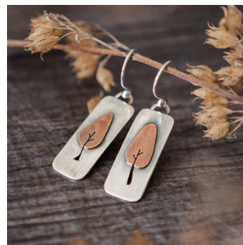
Poplar Drop Earrings