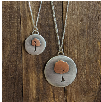
Mini Oak Pendant