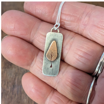
Mini Poplar Pendant